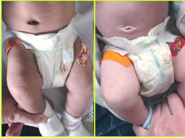
Practice what we preach

Childhood vaccines protect children from a variety of serious or potentially fatal diseases, including diphtheria, measles, polio and whooping cough (pertussis). If these diseases seem uncommon — or even unheard of — it's usually because these vaccines are doing their job. -Mayo Clinic