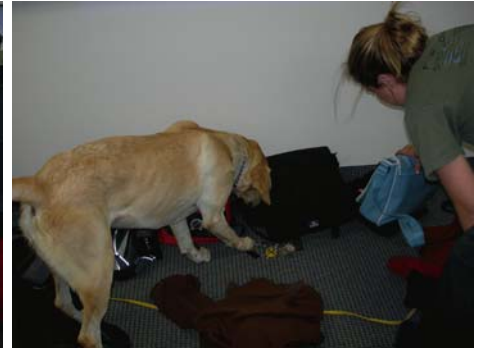
The Narco Dog has now localized the odor source. The Alert behavior cannot be trained into a K-9 ... it is natural behavior.

When a Dog performs an Alert, the Handler - and sometimes a highly skilled K-9 expert - is able to perceive the following: