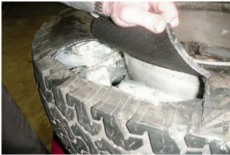
Distraction of tire rubber around Cocaine