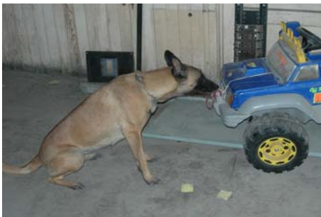
Passive Indication on a stash of narcotics in a child's toy. Notice that the Dog gets its nose very close without touching the source.