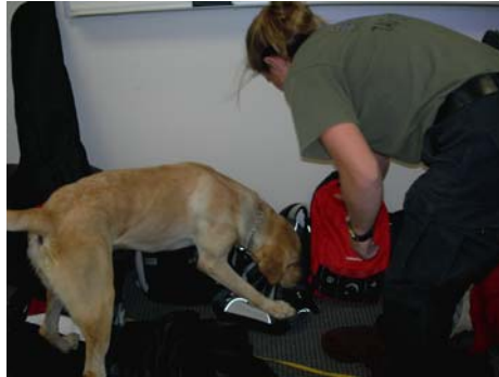
The Narco Dog continues to resolve the exact source of the drug odor. This "resolution" is the Alert.