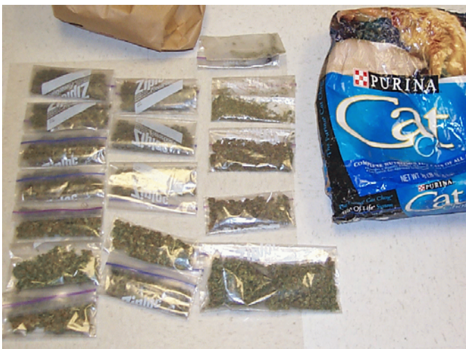
Diversion of Cat food around Marijuana