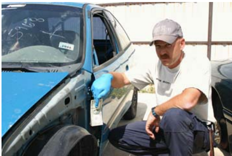
Uncirculated currency being hidden in a vehicle cavity prior to a K-9 Sniff Test.

5. Currency: Drug-tainted currency on which a Narco Dog Indicates has become a hotly-debated legal issue in the past several years. Currently, if currency can be reasonably linked to illegal drug activity, it may be seized by the government. Accordingly, a Narcotics Detector Dog should be trained to disregard and bypass the odor of uncirculated currency, if it should encounter it during the course of a canine sniff. The odor of currency should not accidentally nor purposely become a target odor for a typical Narcotics Detector Dog. Conversely, if a Narcotics Detector Dog Indicates on a location/object and the contents appear to be only currency, then it is obvious that the Indication was on a narcotics odor, not the currency itself. An example is shown below in the sequence of photographs wherein the Narco Dog passes by uncirculated currency and then Indicates on narcotics odor which has odorized the currency with drug odor.