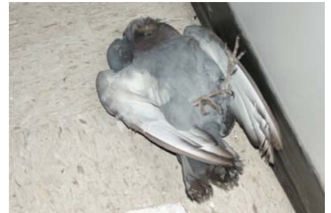
Distraction of a dead bird in a search area.

4. Diversion: A Narcotics Detector Dog should not be thwarted by a "Diversion" while deployed on a canine sniff. For Narco Dog purposes, a Diversion is an odor/object placed in a location with the intent to divert the Dog away from a narcotics stash or defeat the "K-9 Sniff Test" (an example is coffee grounds packed around a quantity of narcotics inside a hidden cavity of a vehicle). It is normal that a properly-trained Narcotics Detector Dog may notice a Diversion. The Dog may even pause momentarily at the Diversion, but a properly-trained Narcotics Detector Dog will not exhibit Alert nor Indication behavior on a Diversion.