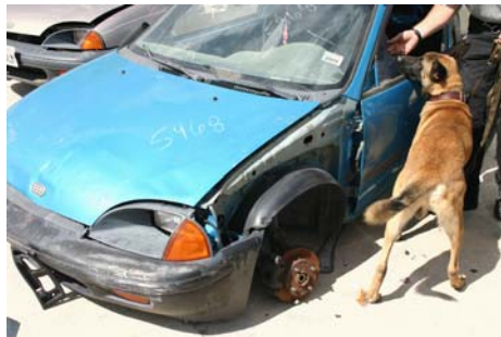
Narco Dog bypasses the odor of uncirculated currency and continues its canine sniff.