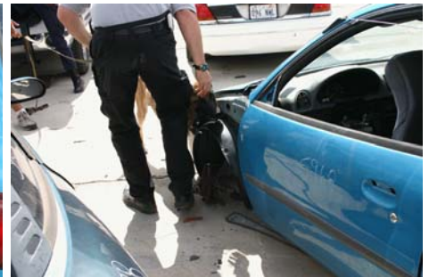
Narco Dog being deployed to conduct a canine sniff of the suspect vehicle.