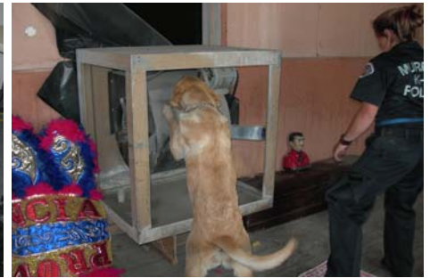
This Narco Dog performs a K-9 Sniff Test in a warehouse.