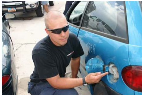
Narcotics being hidden in another cavity within the same vehicle as the currency.