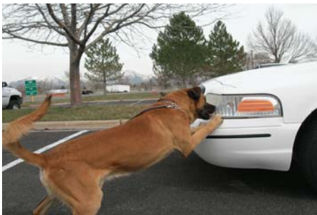
Aggressive Indication on a stash of narcotics.

8. Indicating: Indicating is the trained behavior exhibited by a Narco Dog after it has "Alerted" to a drug odor and "Pinpointed" its strongest source. Indicating is subdivided into behaviors identified as "Aggressive" or "Passive." An Aggressive Indication is observed when a Dog barks, bites, or scratches when it Indicates. A Passive Indication is observed when a Dog sits, stands, downs, or freezes when it Indicates. Either Aggressive or Passive Indication is suitable for a Narco Dog.