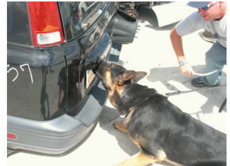
This Narco Dog has Pinpointed the exact location of the odor source and prepares to Indicate.

8. Indicating: Indicating is the trained behavior exhibited by a Narco Dog after it has "Alerted" to a drug odor and "Pinpointed" its strongest source. Indicating is subdivided into behaviors identified as "Aggressive" or "Passive." An Aggressive Indication is observed when a Dog barks, bites, or scratches when it Indicates. A Passive Indication is observed when a Dog sits, stands, downs, or freezes when it Indicates. Either Aggressive or Passive Indication is suitable for a Narco Dog.