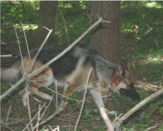
A Wildlife Detector Ranges through a 50 acre wooded area for poached game. Notice the "Wild-Tracking" behavior evidenced by the high nose, showing a balance of Tracking Drive and Air Scenting Drive.