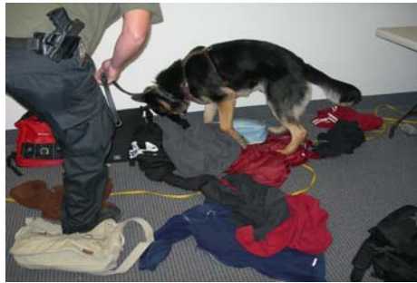
This Narco Dog performs a K-9 Sniff Test on piles of clothing.