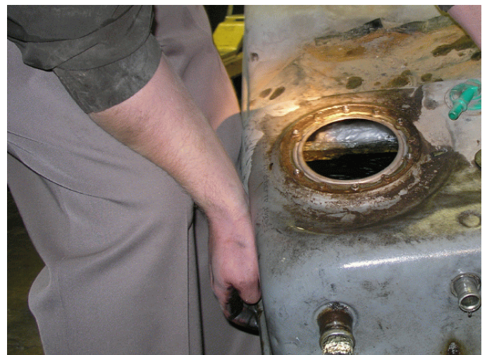
Diversion of fuel to hide odor of Marijuana