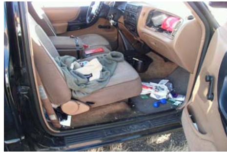
Distraction of human clothing and food around Methamphetamine