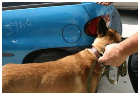
Narco Dog Alerting to and Pinpointing the source of a target narcotics odor.