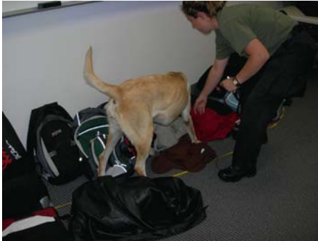
This Narco Dog makes a sudden "head check" and follows the scent cone of drug odor to its source.