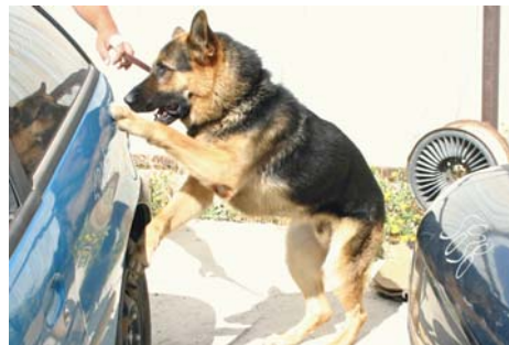
Aggressive Indication at the source of a narcotic odor.