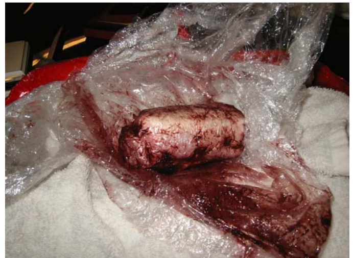
Diversion of automatic transmission fluid around Methamphetamine