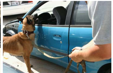
Narco Dog continuing its canine sniff, not influenced by the presence of uncirculated currency.