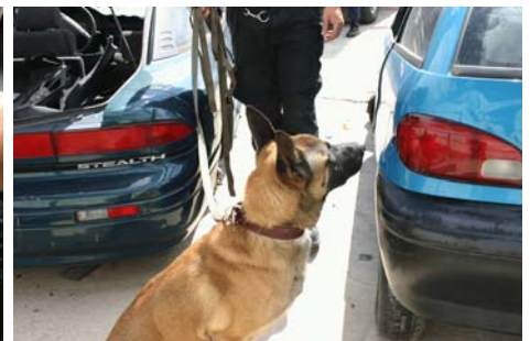
Narco Dog has Pinpointed the source of a narcotic odor and Indicates by sitting, notice the stare at source.