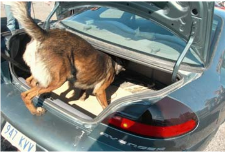
This Narco Dog performs a K-9 Sniff Test in the trunk of an automobile.