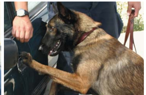
Aggressive Indication on the seam of a vehicle ... narcotics inside.