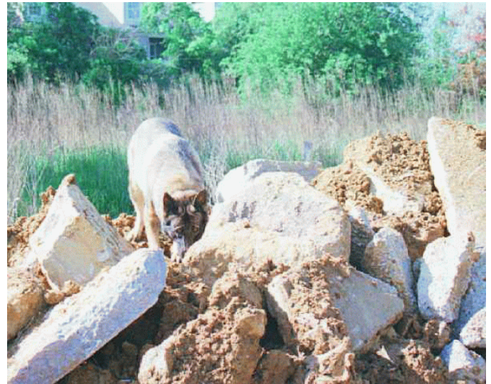
A Cadaver Detector Dog Ranges through a large rubble pile search area in an attempt to locate decomposed human victims. This rubble pile was almost 2 acres in size.