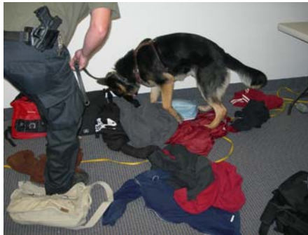
This Narco Dog has Pinpointed the exact location of the odor source and prepares to Indicate.

7. Pinpointing: If a Narco Dog is deployed on a search for the presence of a target odor, it shall do so as described herein. If it perceives a target odor, it shall immediately pinpoint the source of the odor. Pinpointing differs from Searching in that it is evaluated as independent behavior manifested by the Dog, whereas Searching is a Handler-controlled behavior.