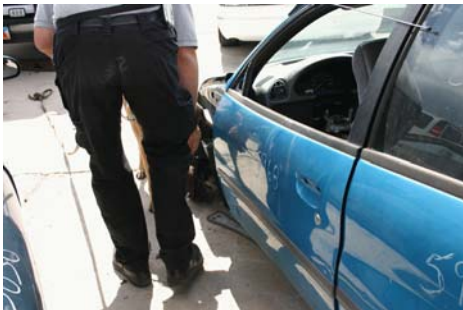
Narco Dog sniffing the cavity of the vehicle wherein the uncirculated currency has been placed.