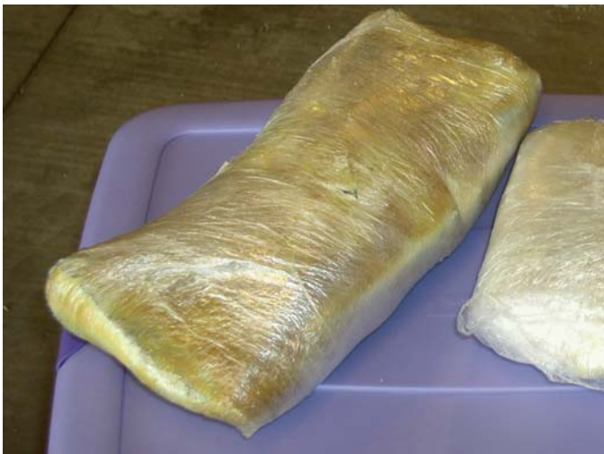
Diversion of mustard around packets of Marijuana

4. Diversion: A Narcotics Detector Dog should not be thwarted by a "Diversion" while deployed on a canine sniff. For Narco Dog purposes, a Diversion is an odor/object placed in a location with the intent to divert the Dog away from a narcotics stash or defeat the "K-9 Sniff Test" (an example is coffee grounds packed around a quantity of narcotics inside a hidden cavity of a vehicle). It is normal that a properly-trained Narcotics Detector Dog may notice a Diversion. The Dog may even pause momentarily at the Diversion, but a properly-trained Narcotics Detector Dog will not exhibit Alert nor Indication behavior on a Diversion.