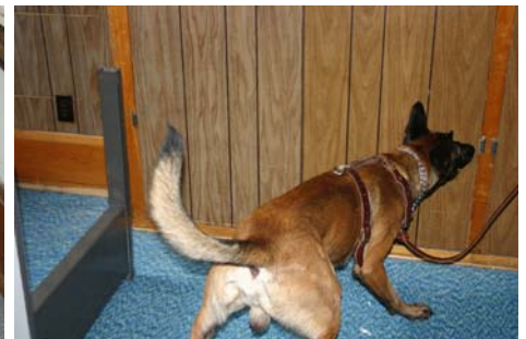
Passive Indication on a drug odor via a "Point" ... this Dog was so intent that it even "flagged" its tail like a hunting dog.

It is critical to note that the trained behavior is likely to be exhibited only when the Dog is physically able to do so. For example, if a Narco Dog Alerts to odor and crawls underneath a vehicle as it Pinpoints, it may not be able to scratch due to the confined space ... and may just freeze in position. This is, nonetheless, an Indication to the Handler that the Dog has located the strongest source of odor.