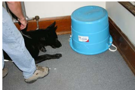
Passive Indication on a target odor via a "Down" position. Notice the intense stare at the source of the odor.