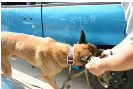
Narco Dog continuing its canine sniff, in spite of the presence of uncirculated currency.