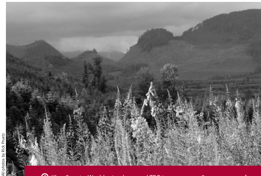
(a) King County, Washington has used TDR to preserve 138,000 acres so far, including the 90,000-acre Snoqualmie Forest.

ture. But sometimes communities intentionally separate receiving areas from existing development to promote community acceptance, often using new-town or new-village concepts.