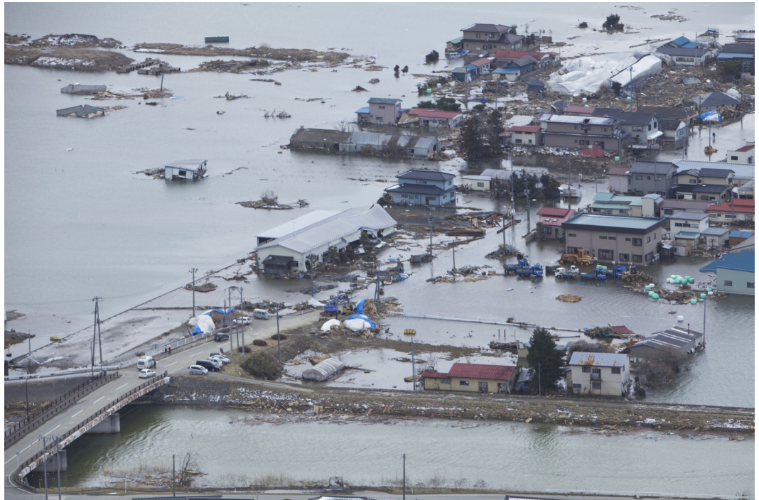
Minato, Japan was devastated following the March 11 earthquake and tsunami. We've learned it takes more than government to recover.

Government can no longer assume that it can solve disaster management challenges on its own, and how effectively government at every level engages with and leverages the resources of other segments of society will determine how suc-