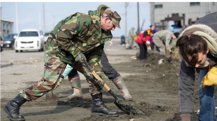
Hachinohe, Japan.