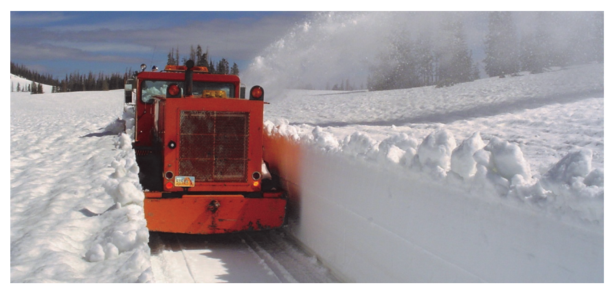
Interested in photos and stories of Utah's disasters over the years? Visit our Flickr site and Natural Hazards & Mitigation Blog <a href="http://www.flickr.com/photos/utahnaturalhazards/">http://www.flickr.com/photos/utahnaturalhazards/</a> <a href="http://uthazardmitigation.wordpress.com/">http://uthazardmitigation.wordpress.com/</a>