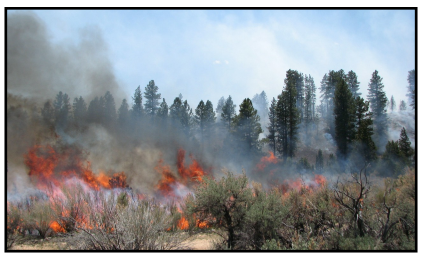
Garfield county - 2011 Fire near Boulder

An assessment takes into account factors such as major economic impact and whether the fire threatens lives and improved property including critical facilities, critical infrastructure or critical watershed areas.