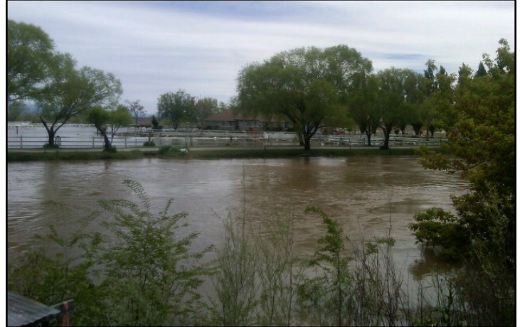
Weber County

At the state, our liaisons are working hard in keeping us informed of all the flood preparation activities throughout the state. We are inputting