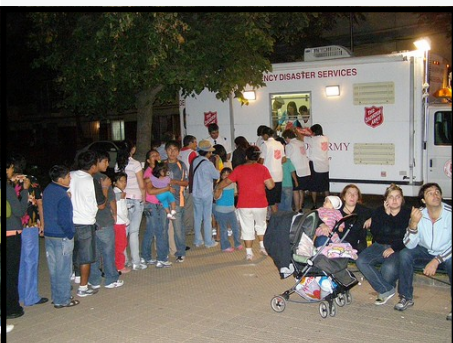
Salvation Army response with food, water and kits to the earthquake in Chile, 2010.

The Team is currently looking for members from Southern Utah to join the group. The monthly meetings may be attended by conference call.