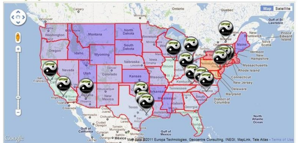
States ranked by zombie survivability

normal - lightning - tornadoes - hurricanes - zombies - meteors - prickly animals