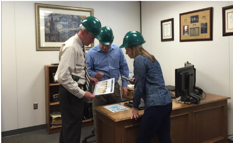
DPS Administration reviews the continuity of operations plan as part of the Great Shakeout Drill

Earthquakes in Utah are real, and so are Earthquake drills. Thanks to more than 20,000 State Employees and hundreds of thousands of Utahns, this year's statewide earthquake drill was another resounding success. Across the state, 960,000 people were registered to participate in the 2015 Great Utah ShakeOut. Our previous record was in 2012 when 945,000 participated. We should all be prepared to drop, cover and hold on. Those actions are most likely going to keep you safe in an earthquake. The event garnered significant media coverage in addition to great participation.