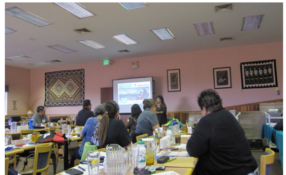
Attendees of the 8th Annual Four Corners Injury Prevention Meeting

DPS divisions continued to work directly with Utah's Native American Tribes in April. The Highway Safety Office helped host the 8th Annual Four Corners Without Borders Injury Prevention Meeting in Monument Valley on April 7th and 8th. This meeting brings together traffic safety advocates, law enforcement, EMS and other partners from Utah, Arizona, New Mexico and Colorado to address health and safety issues facing the Native American population. The Division of Emergency Management continued to work with tribes throughout the State by conducting the DPS Tribal Advisory Committee meeting and holding individual meetings with representatives from the Skull Valley Goshutes and Navajo Nation to address emergency management and homeland security issues.