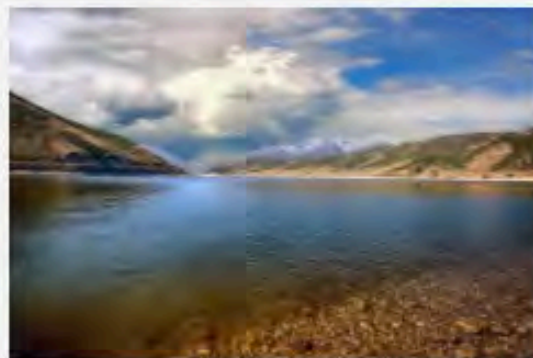
Deer Creek State Park