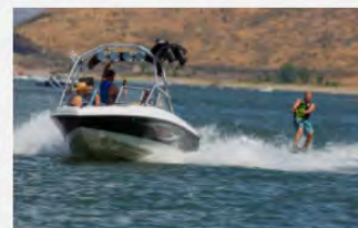
Deer Creek State Park