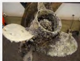
Quagga mussels on a boat propeller