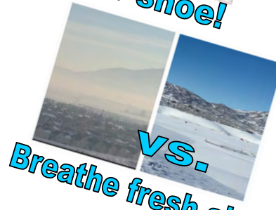
Breathe fresh air!