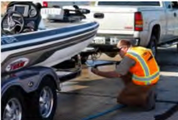
DNR staff decontaminating a boat

“Our prevention and containment methods worked,” Owens says. “Decontaminating boats that arrived at Deer Creek from Lake Powell and infested waters outside the state prevented mussels from getting into the reservoir and adding to the problem. And requiring boaters to clean and drain their boats—before leaving Deer Creek—prevented any mussels that might have been in Deer Creek from being spread to other waters in the state.”