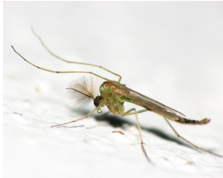
Family: Chironomidae midge fly

As you look at these two pictures what looks the same and what looks different.