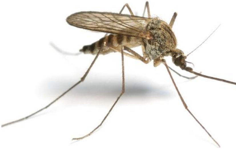
Family: Culicidae Mosquito